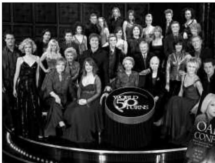
As the World Turns recently celebrated its 50th Anniversary. It debuted April 2, 1956, on CBS. This year the lively soap opera received 12 Daytime Emmy nominations.

I am not blonde. I am rarely perky. My butt, alas, could use some bustin'. And as for